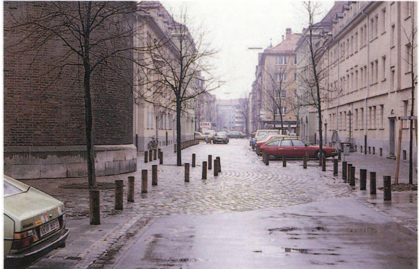
6: Granite setts following the curved wall of a church mark out a lateral shift, and thus emphasize an attractive feature of the street. Nuremberg, Germany.